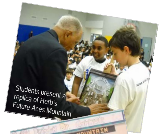
Students present a replica of Herb's Future Aces Mountain

The Herbert H. Carnegie Scholarship was a surprise birthday gift to Herb. Friends and family have until April 9th, 2010 to contribute to this legacy of learning that will benefit hundreds of students in honour of Dr. Carnegie. You may donate via credit card by calling 905.947.9131 or sending your cheque to the Foundation Office at 7170 Warden Avenue. On-line donations are also gratefully accepted. Donors will receive a receipt and will be listed on the Foundation website.